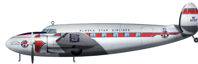
1943 LOCKHEED LODESTAR