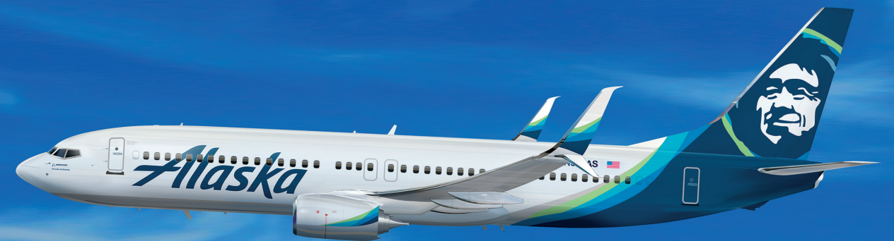
2016 BOEING 737-800