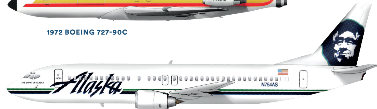
1992 BOEING 737-400