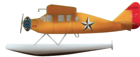
1934 BELLANCA PACEMAKER

From 1930s-era bush planes to Boeing's newest 737s.