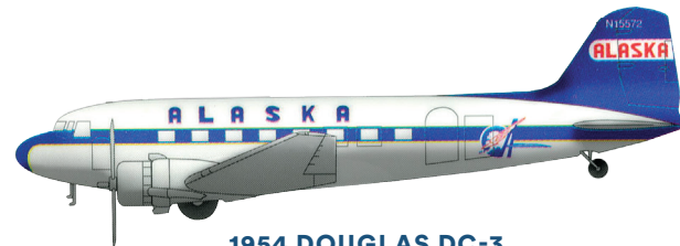
1954 DOUGLAS DC-3