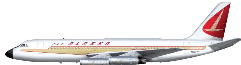
1961 CONVAIR 880